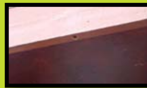
Carpenter bee entry on fascia.