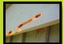
Carpenter bee gallery exposed ... attractive to birds.