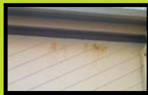
Carpenter bee staining on fascia board of house.

Both males and females can be aggressive and territorial as well, and will dive bomb you as you approach their nest sites. However, stings from female carpenter bees are rare. (Males do not have a stinger and do not sting at all.) Still, most homeowners do not want to have to deal with aggressive bee like pests that destroy their home. Remember to call us, your pest professionals to assist you in treating and preventing further carpenter bee attack and damage to the wooden parts of your home. We'll get those carpenter bees to buzz off ... so you can enjoy the nice spring weather! ■